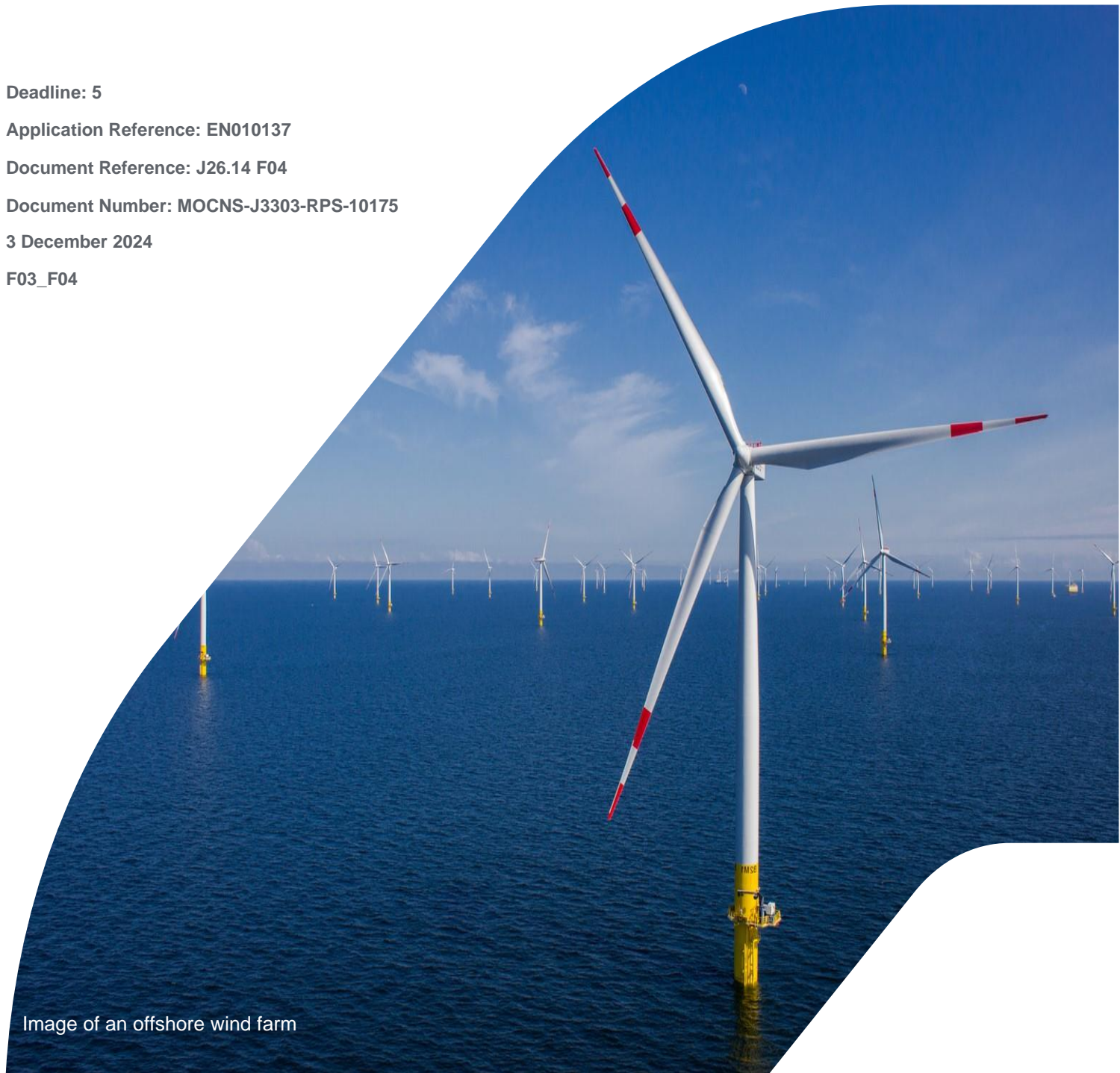
Image of an offshore wind farm